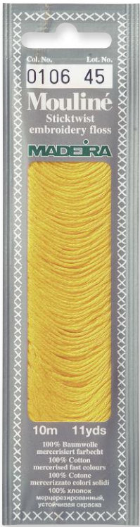
Mouline 379 colours / 10 m