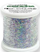
Spectra 6 colours / 100 m

Resistant to washing up to 95°C (210°F) and chlorine. The right thread for embroideries on textiles which need to be washed frequently like tablecloths or napkins.