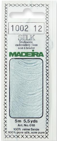
Silk 108 colours / 5 m