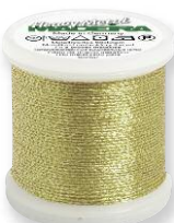
Heavy Metal No. 12 6 colours / 50 m 50% Polyester 50% metallized Polyester