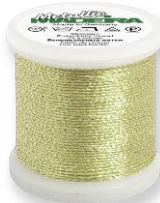
Metallic No. 12 8 colours / 40 m 70% Viscose 30% metallized Polyester