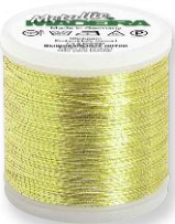
Metallic No. 6 2 colours / 50 m 75% Viscose 25% metallized Polyester