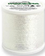
Metallic No. 120 18 colours / 1000 m 45% Polyamid 55% metallized Polyester