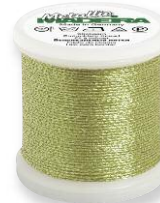
Metallic No. 15 4 colours / 100 m 60% Polyester 40% metallized Polyester