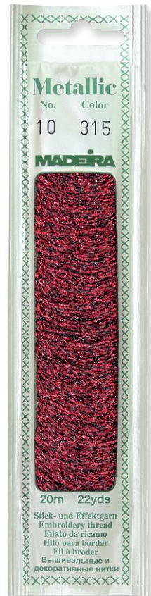
Metallic Perlé No. 10 24 colours / 20 m 40% Polyamid 60% metallized Polyester