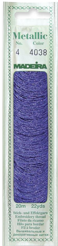
Metallic Mouline No. 4 24 colours / 20 m 60% Viscose 40% metallized Polyester