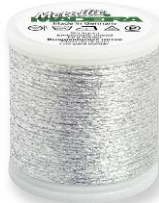
Metallic No. 20 2 colours / 50 m 45% Polyamid 55% metallized Polyester