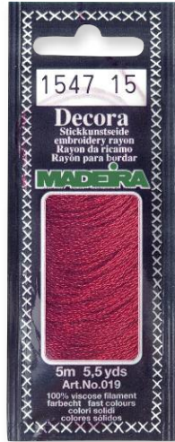
Decora 90 colours / 5 m