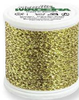
Metallic No. 25 4 colours / 40 m 100% metallized Polyester