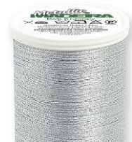
Metallic No. 15 4 colours / 300 m 60% Polyester 40% metallized Polyester